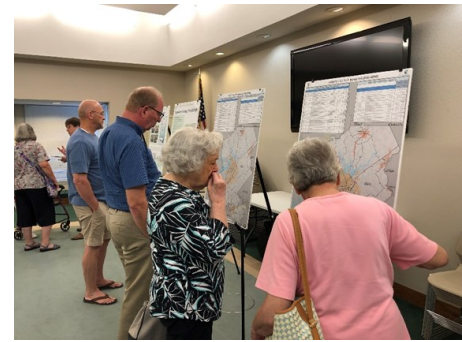
Citizens review draft project lists at the Blackshear Place Library Open House on August 19, 2019

The federally-required update of our Regional Transportation Plan is ongoing. On September 17, 2019, the GHMPO Policy Committee approved the draft project lists that utilize state and federal funds as well as project lists that utilize other funding sources such as House Bill 170 funds. These project lists are available here . See the project website for more details and updates.